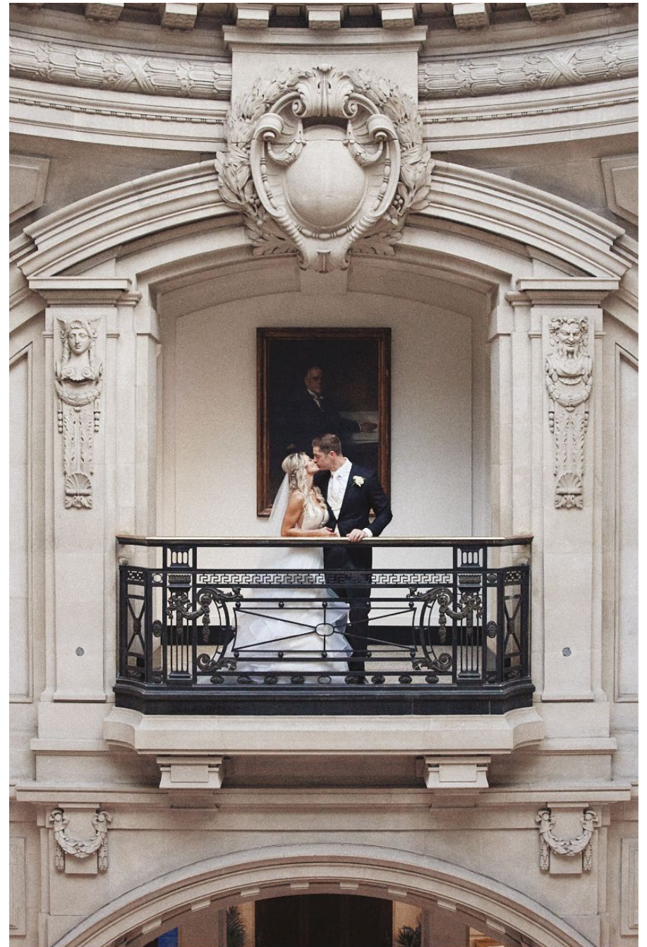
GLASS DOME & BALCONY