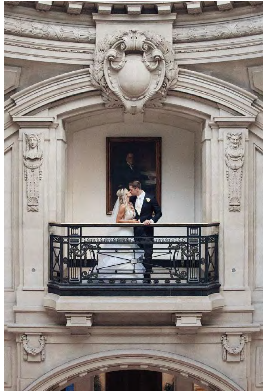
GLASS DOME & BALCONY