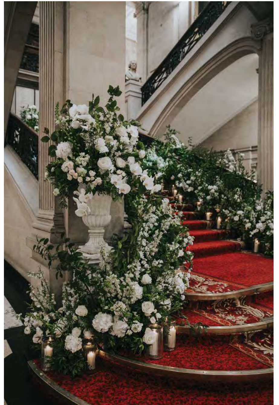
THE GRAND STAIRCASE